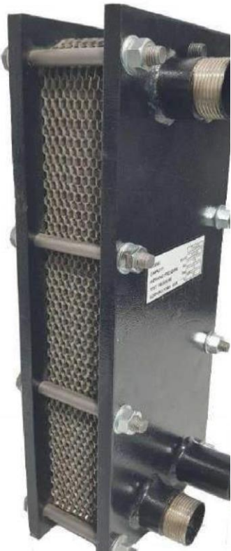
Plate Heat Exchanger